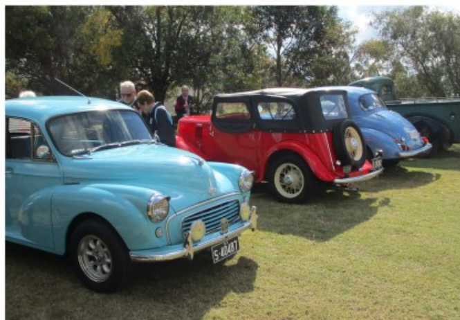
The Official Newsletter of the Toowoomba & Downs Morris Group