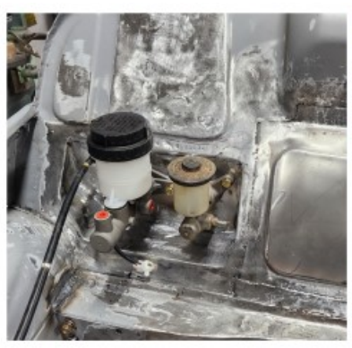
tre. You will see the idea in the pics.

needed to fit the respective master cylinders in to the position that I wanted and required, so that it will not (hopefully) interfere with the engine ancillaries when that time comes to fit the motor and box. I have done the MC set up different to others who install the big round booster and cylinder setup more to the cen-