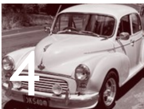
Cars & Coffee