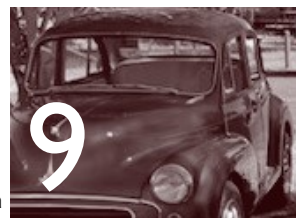
CAR Inc, Warra