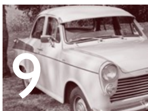
Adventure To Allora